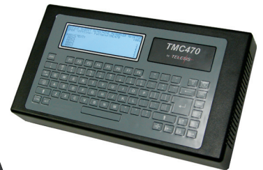
Compact Self-Contained TMC470 Controller